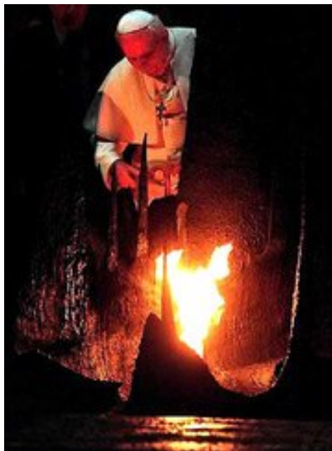
Pope John Paul II at Yad Vashem