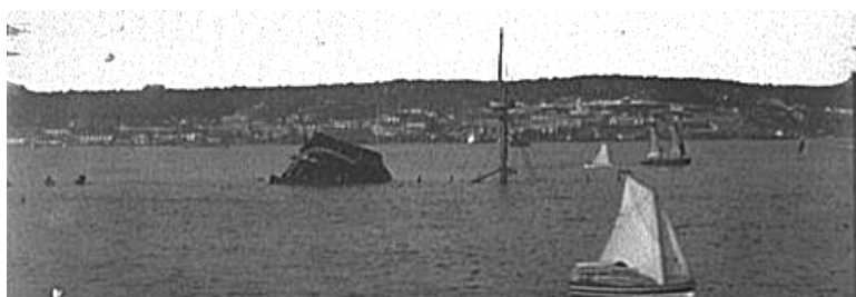
The wreck of the U.S.S. Maine

A seminar course is only as good as its most daunted member, so I expect everyone to come to every class prepared to delve into the major issues and questions raised by the primary sources and our secondary readings. While I welcome office visits at any point, several one-on-one consultations are built into the syllabus to make sure no one's concerns fester. Most of our class time will be spent in discussions based on close textual exegesis of the course readings and your own research. You should always bring the course materials with you to class.