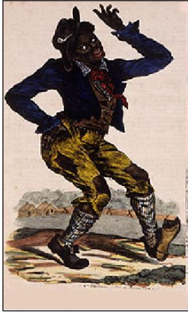
Jim Crow, stock minstrelsy character