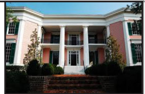
The T.R.R. Cobb House

My father passed down his love of history to me when I was very young. Ever since before I can remember, family vacations have always included or been based around something