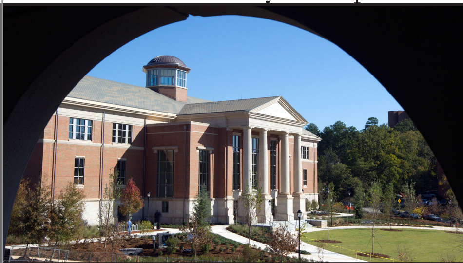
The New Richard B. Russell Library for Research and Political Studies